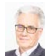
Lord Adair TURNER

Professor of the Practice of Economic Policy, Harvard Kennedy School and the Department of Economics at Harvard University; Former Chair of Council of Economic Advisors of the White House 美国哈佛大学教授、美国白宫经济顾问委员会原主席